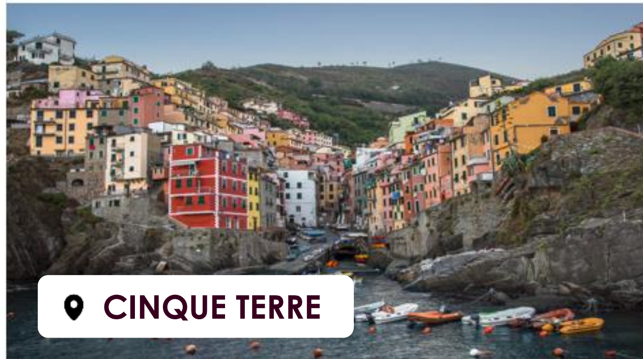
📍 CINQUE TERRE