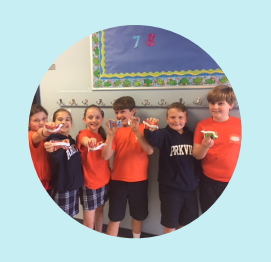
TALK TO YOUR CHILD ABOUT KINDNESS & GOD'S WORD