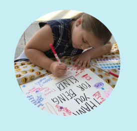
COMPLETE KIND ACTS WITH YOUR FAMILY